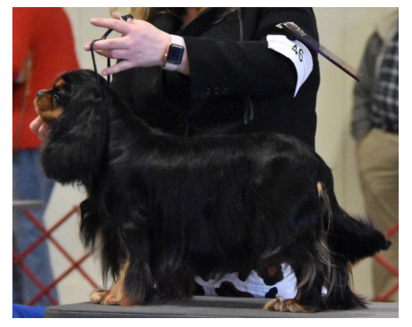
Black and tan dog shown by exhibitor wearing black jacket