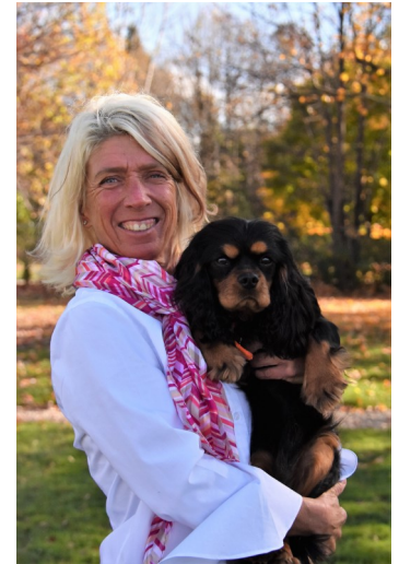
Portrait with diffuse light under shade tree